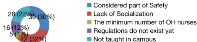
Figure 2. Why OHN is not widely known in Indonesia (n = 130)

have not, the respondents show that nurses strongly agreed with the difference in insight between those who have attended OHN training and those who have not. The majority of Indonesian nurses who agreed to those differences were 68 nurses (52.3%).